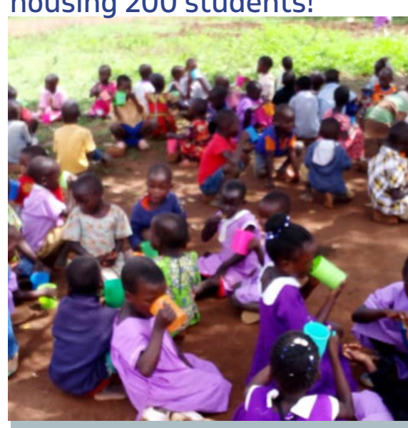
Nakalama Christian Community Primary School

We have several construction projects going on including the Primary Girl's Dormitory, which is nearly complete and perimeter fence and Girl's Dormitory projects at LCCHS which are fully complete. Speaking of dorms, our boarding school is currently housing 200 students!