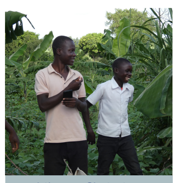
Liberty Christian Community High School

We established farms where students and staff participate in crop production to supplement school meals. Many parents learned how to use the school pay system, which has made the payments of school fees easier.