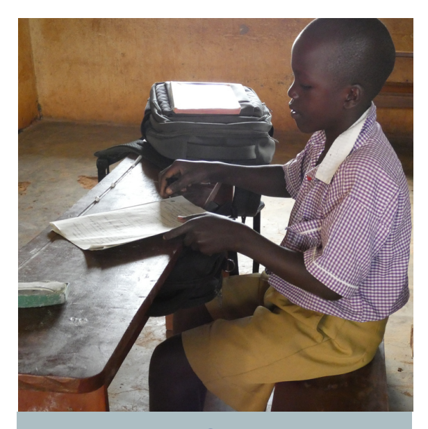
Bulike Christian Community Primary School

We were able to finish the year successfully with 46 children sitting for their Primary Leaving Examinations and 32 students successfully completing Senior Four National Examinations.